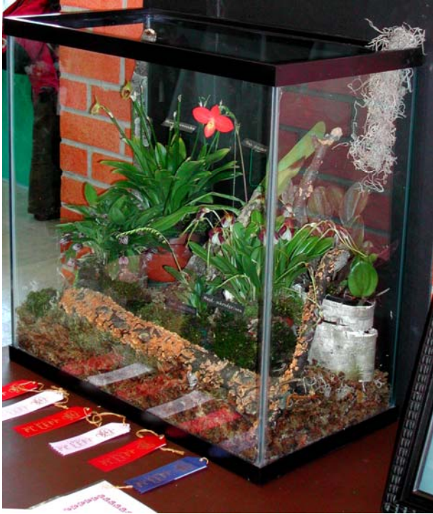
Susan Haddock's Fish Tank Display is lovely!