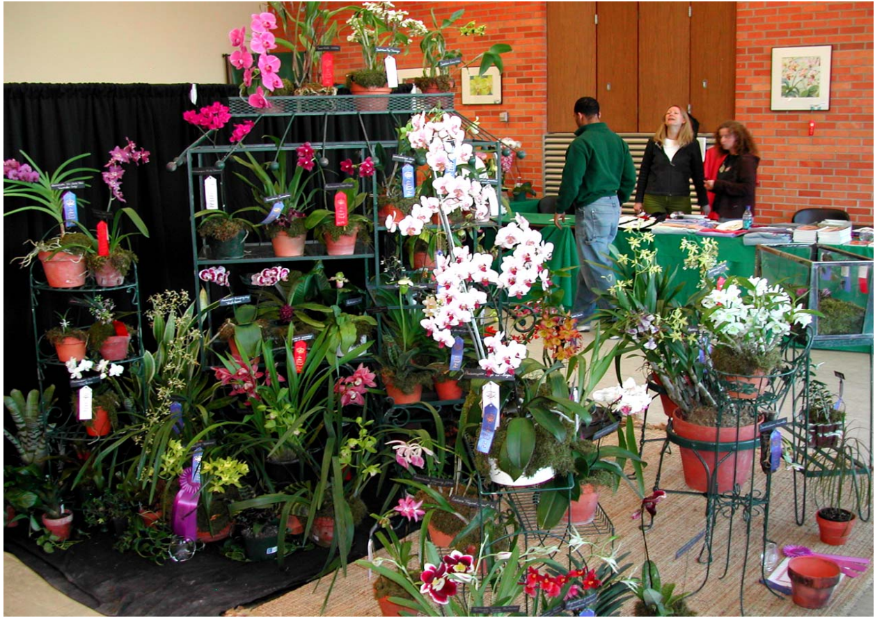
Didn't the display turn out nicely? Thanks a lot to all contributors! And look at all those ribbons!!!