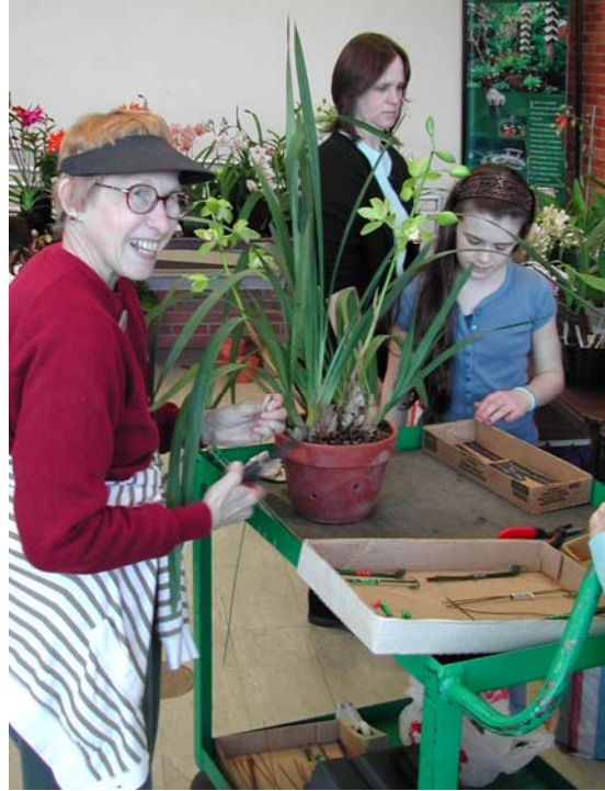
Plant preparation is very important