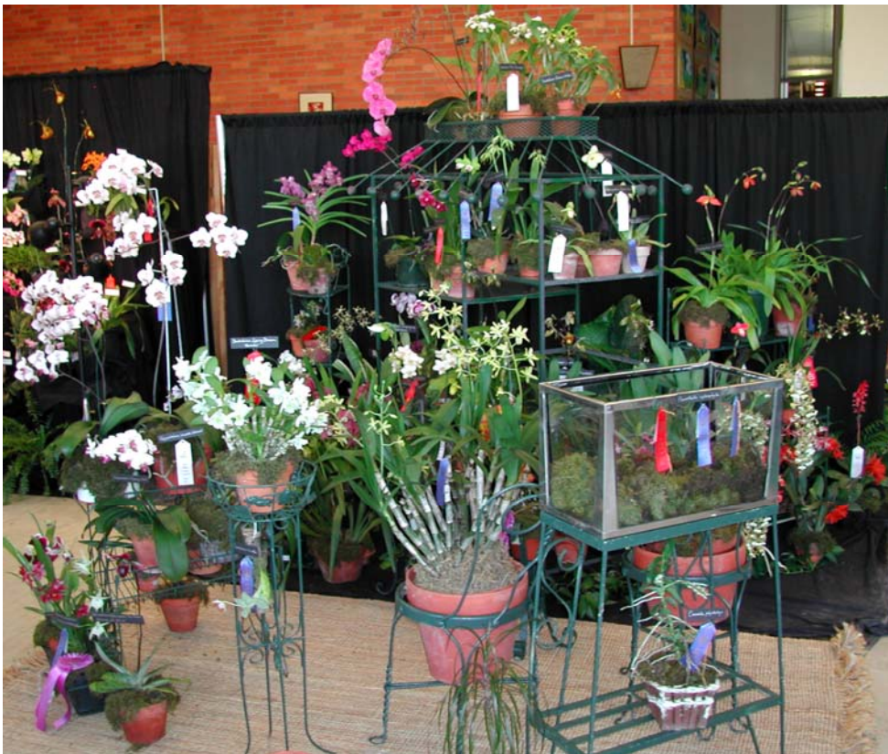
Another shot of our Festival display! Congratulations everyone!