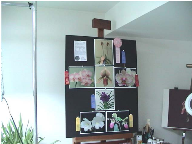
Dee's Award-Winning Plants